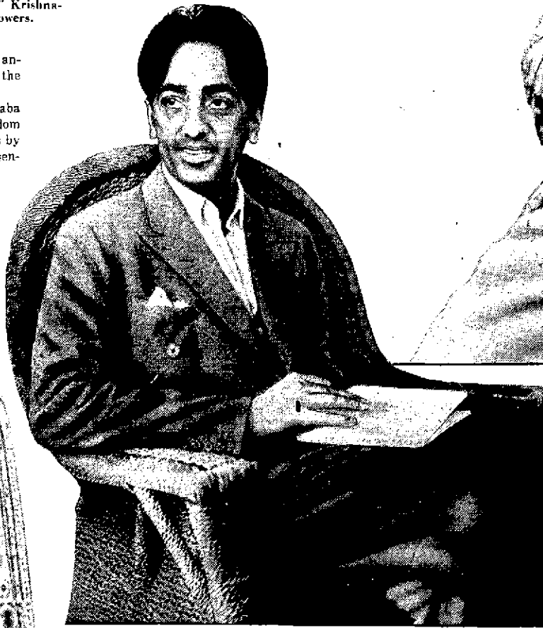
Jeddu Krishnamurti, a "Messiah" Appointed by the Late Annie Besant, the Head of the Theosophists of the World.

first among the millions of Theosophists, the tremendous influence of their leader caused the great majority to accept the youth at her own valuation. A great international organization, "The Order of the Star," was formed, with Krishnamurti as its head, to receive and spread the new gospel. The sincerity of the members is proved by the way funds poured in. These allowed the boy to travel around the world in state like a prince, though old-style messiahs had to go it mostly barefoot and begging their way. In Australia, a huge concrete stadium was built especially to hear and see him. They showered wealth on him in the form of real estate in various parts of the world including the Castle Feerde, in Ommen, Holland. In Paris he attracted a larger and more imposing gathering of wealthy society women than probably would have turned out for any other foreigner except Lindbergh. Col. Lindbergh had to risk his life to become known, but Krishnamurti merely had to travel around in luxury, and while waiting for the message to come, make a few very simple addresses to his followers. It seemed about as easy and success-