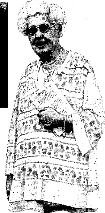
The Late Dr. Annie Besant, Who Picked Out Young Krishnamurti and Started Him on His Career as a "Messiah," Which He Has Now Abandoned.