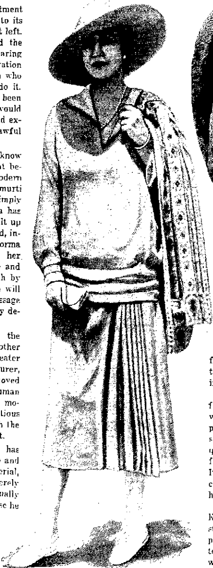
The Princess Matchabelli, Who Gave Up Home and Career to Become a Devoted Follower of Meher Baba.

When the news was flashed to all countries it created a sensation, but though there was some discussion at