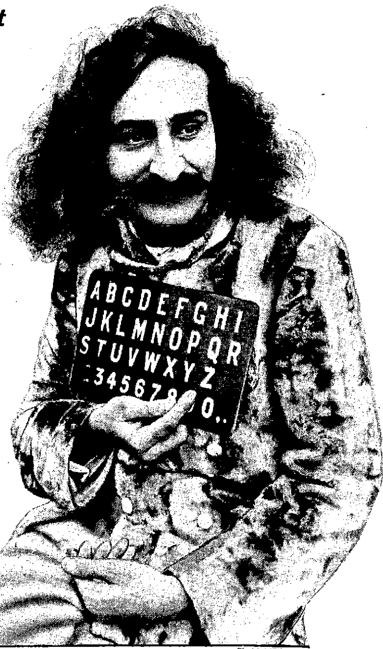
Shri Meher Baba, a Holy Man of India, Who Says He Can Work Miracles and Has a "Message" for Mankind. He Has Not Spoken a Word for Eight Years and Now and Then Answers a Question by Spelling It Out With His Fingers on an Alphabet Board.

In disgust the messiah disbanded the organization saying that his message was for the whole human race and no society or creed. He was now free from his society, his worldly possessions and soon broke away from his sponsor and discoverer. In 1931 he turned up at Los Angeles, unannounced, and when discovered by the press, stated that his interviews would no longer be "staged." He said that