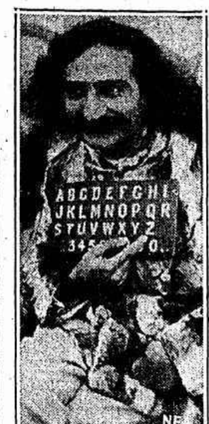
Shri Sadguru Meher Baba... and the alphabet board which is his only medium of communication with the world.

Parsee Mystic Plans to Break Long Silence While on Visit to United States.